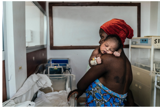
Photo: Every month, 300 babies are delivered in the Mbeya Regional Referral Hospital, Tanzania. © UNICEF/Reinier van Oorsouw, in July 2017.

Join the pre-learning event discussion: Participate in the pre-survey for organizations or Participate in the pre-survey for countries