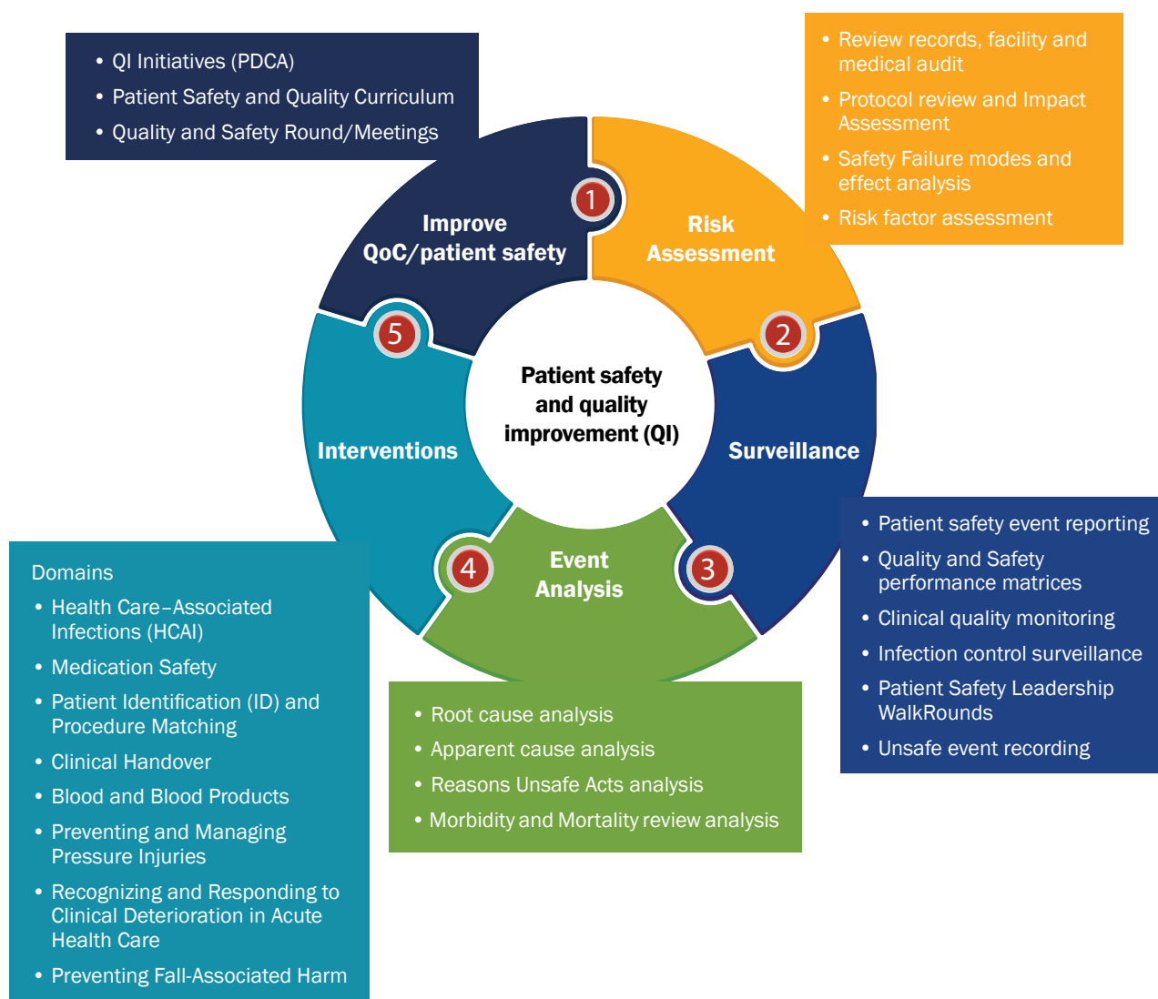
Figure 2: Implementation framework

In order to plan, risks in the facility will be assessed by the assigned team or groups through continuous surveillance system. Documentation will be done of errors identified and gaps in patient safety as per guideline and checklist. Then the interventions will take place in eight domains of patient safety in the facility. Improvement of patient safety will be checked and acted through QI Committees. Feedback will be provided and followed-up.